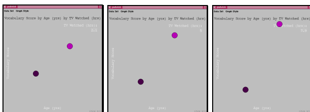
Figure 2 Mapping x and y to screen-position.